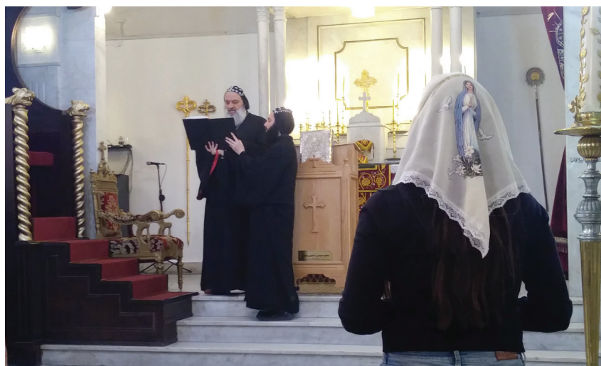
Syrian Orthodox Patriarch Ignatius Aphrem II presides over Lenten mid-day prayers in the Old City of Damascus. February 2018.

Throughout Syria, God's rule is manifest as churches continue to gather to worship and give thanks to God. The number of Christians in Aleppo may have fallen from two hundred thousand before the war to thirty thousand today—with Syrian Christians joining Syrian Muslims in fleeing the country for safety—yet the Sunday we worshiped at the American Evangelical Church, the large sanctuary was full, and fifty children presented their monthly program of praise songs.