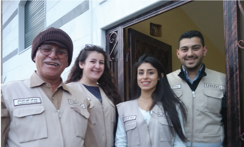
Volunteers with the Umm al-Zinaar Relief and Development Committee in a village near Homs. February 2018.