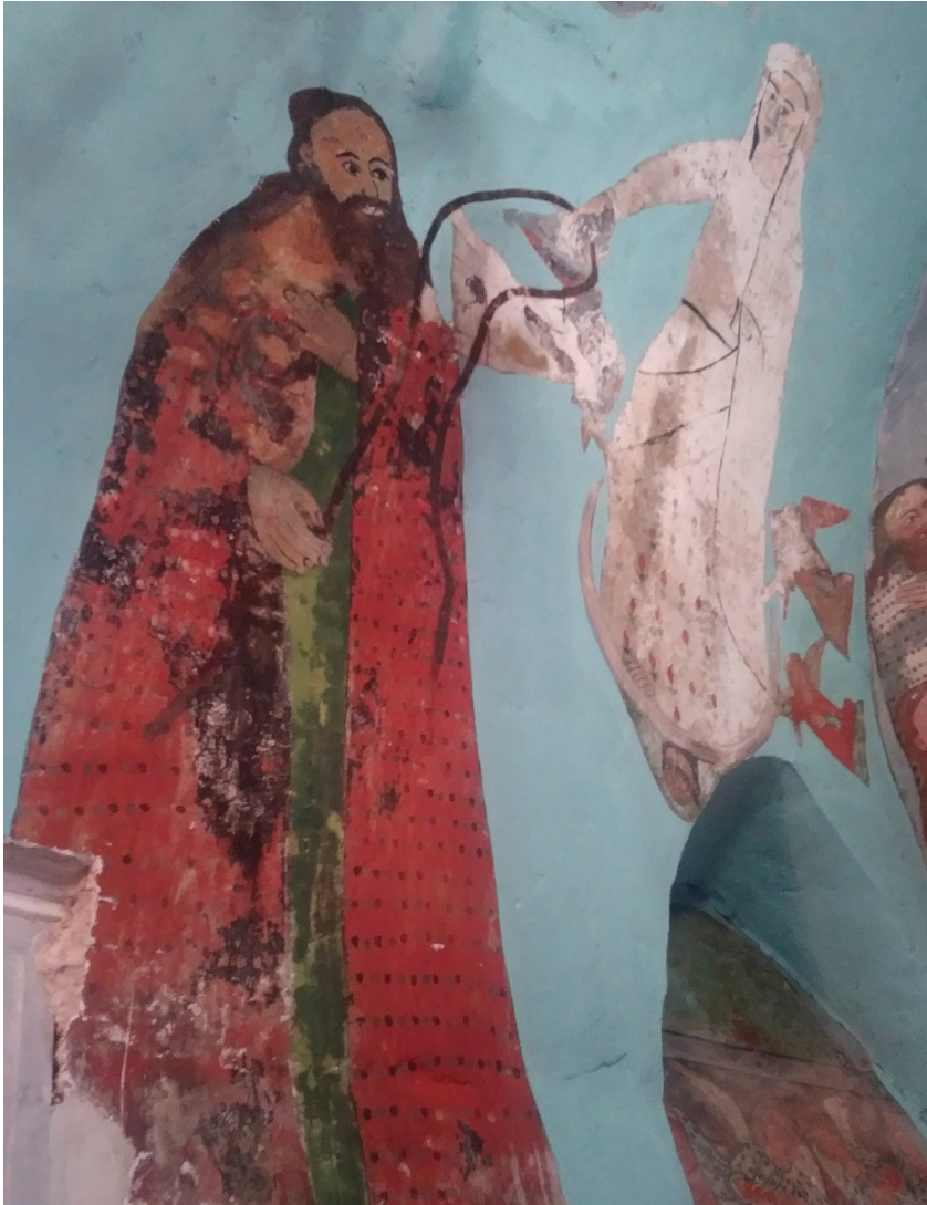
Eighteenth-century painting of Thomas's encounter with Mary, the Mother of the Belt, in a Syrian Orthodox church in a village in the Qalamoun Valley. February 2018.

church's history that became a touchstone for me throughout my time in Syria, a story I kept coming back to as I searched for signs of God's rule within a landscape of devastation. As I studied the murals, I was able to decipher most of the figures and the stories from the Bible and church history they represented, but one image stumped me. I turned to the local Syrian Orthodox priest to ask who these figures were, and he proceeded to tell me the story of the zinaar , or "belt."