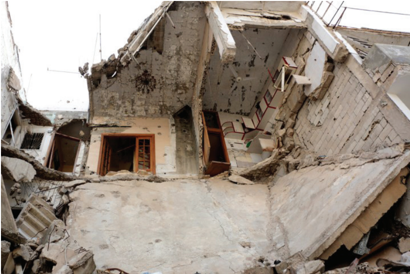
Destroyed home in Wadi al-Sayegh neighborhood, Homs. February 2018.

This torrent of grim statistics felt unrelenting, and what we saw and heard gave disturbing reality to these numbers. In Homs, we drove by shelled-out and destroyed apartment buildings for kilometer after kilometer; entire sections of the city had been turned into mute ghost towns. We walked through the badly damaged Christian neighborhood of Wadi al-Sayegh in Homs, looking up at the remnants of a family's kitchen, the cupboards still clinging to ruined walls.