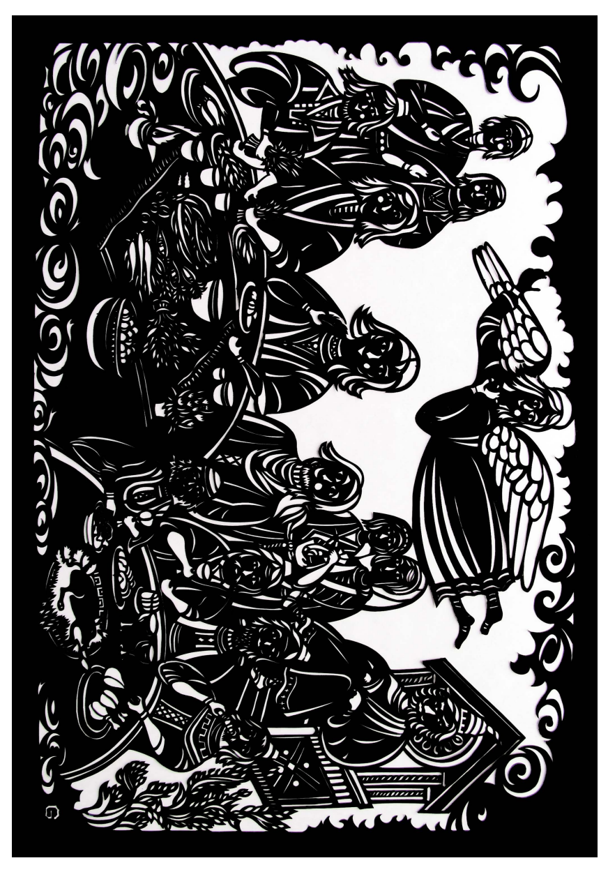
Image 4. Gen Tsuboi. Japan, God's Plan 2 , 2010. Kirie (Paper cut), 31 x 21.5 inches. Artist copyright.