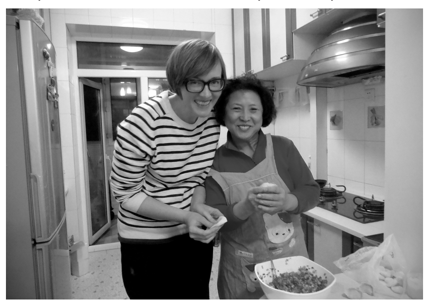
Photo 1. Author enjoys preparing a meal with her host.

Because I love cooking, I always enthusiastically ask host families about local cooking methods. Besides enjoying ourselves, spending time in the kitchen with families also helps break down cultural barriers. Sometimes my students' parents seem nervous when I arrive, not knowing what to talk to me about, as I am an obvious foreigner being both tall and blond. I think my curiosity about food creates an easy way to connect. My hosts are usually surprised that I have questions about their cooking methods, because to them it's all so easy and obvious. But China is a large country with several distinct regional cuisines, and even dishes with the same names are cooked differently from town to town. So I always feel I have more to learn, and I'm always curious. My hosts like that.