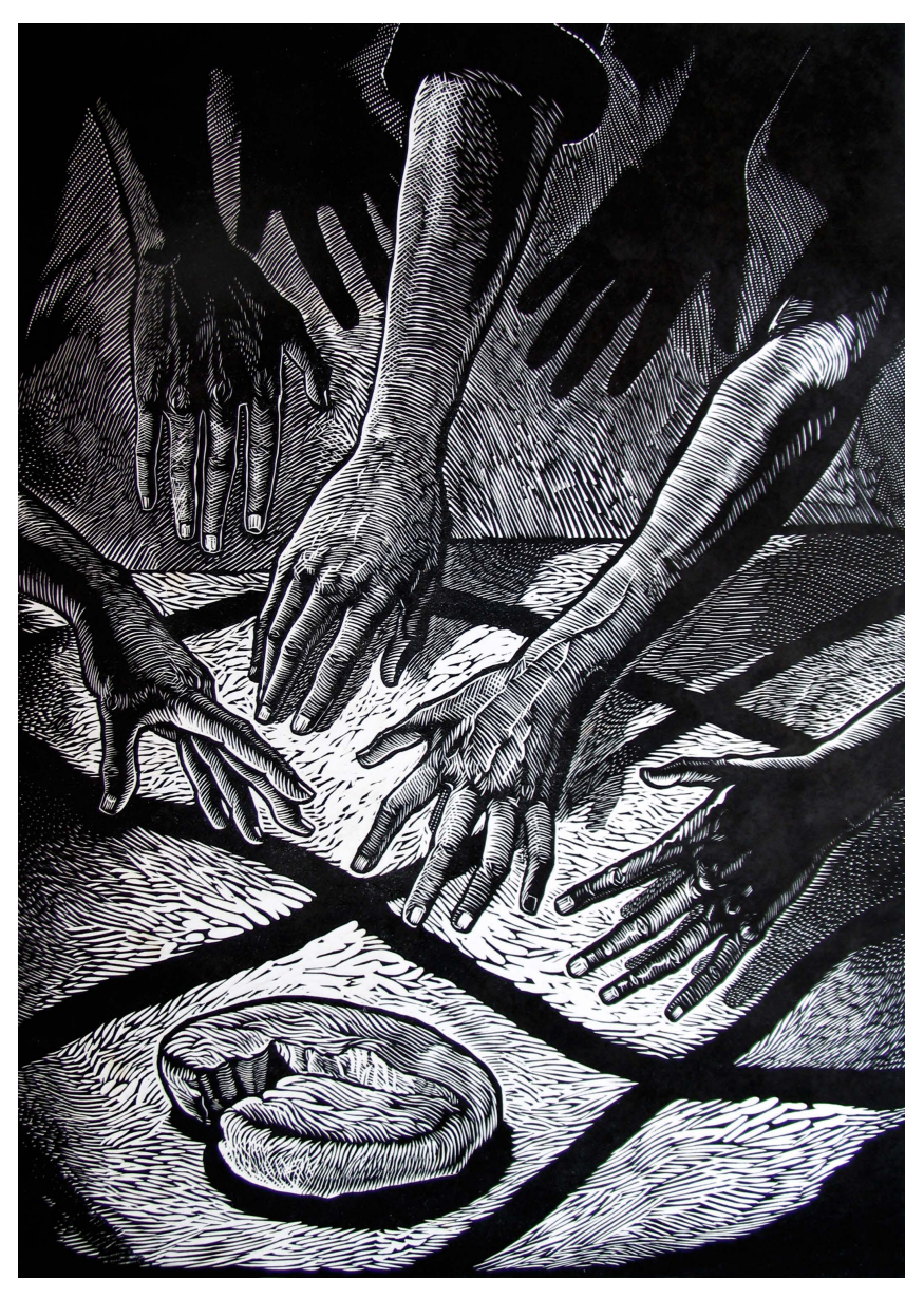
Image 1. Alejandro Aranda. Mexico, La Busqueda (The Search), 2010. Linocut, 20 x 28 inches. Artist copyright.