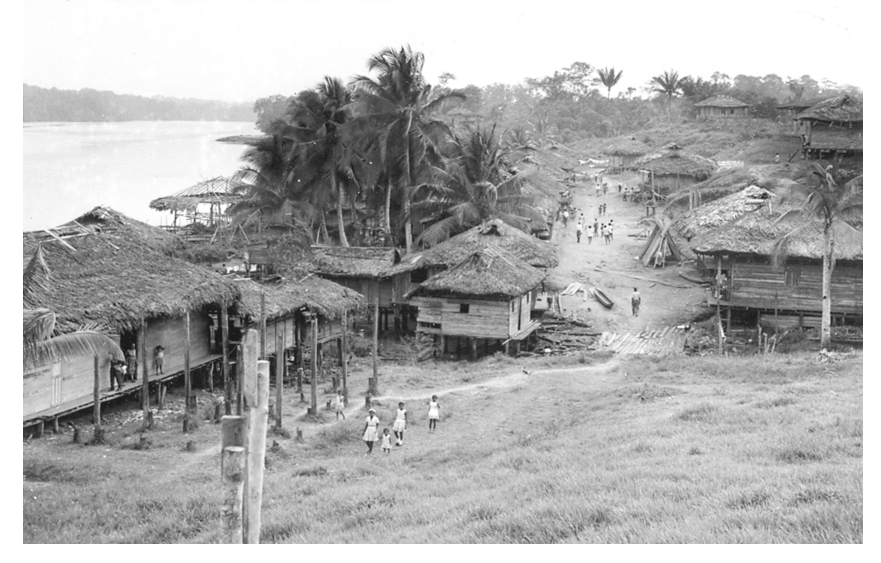
Photo 1. The village of Belén de Ocampadó in Chocó. By 1964, a church of twelve believers had formed here.

cultural and social focus. 15 Given the general lack of roads in the region, Istmina's strategic location at the confluences of the San Juan and San Pedro Rivers guaranteed the Mennonite Brethren access to communities downriver all the way to the Pacific Ocean. 16 By the 1950s the Mennonite Brethren and their ministries were known up and down the San Juan River and its tributaries, even beyond what could be traveled in a multiple-day canoe trip.