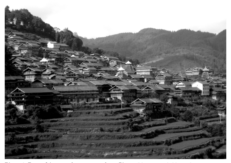
Photo 2. Beautiful terraced mountainside in China

Once, in southwest China, I spent a week in a student's home that was so remote and surrounded by mountains that they had only had contact with the outside world for the last twenty years. I was told that I was the first foreigner to visit some of the surrounding villages. Because of the mountainous landscape, at least half of the items at the market were wild vegetables foraged from the steep slopes. My student's mom told me it was a relief to host me as a vegetarian because not only did she not have to buy expensive meat every day but she could also show off the rich local variety of wild greens. We ate about twenty different wild greens at our meals that week. Most of them didn't have names—they are simply called "ye cai" or "wild vegetable"—but the locals could tell by sight if the flavor would be sweet, bitter, garlicky, or reminiscent of parsley.