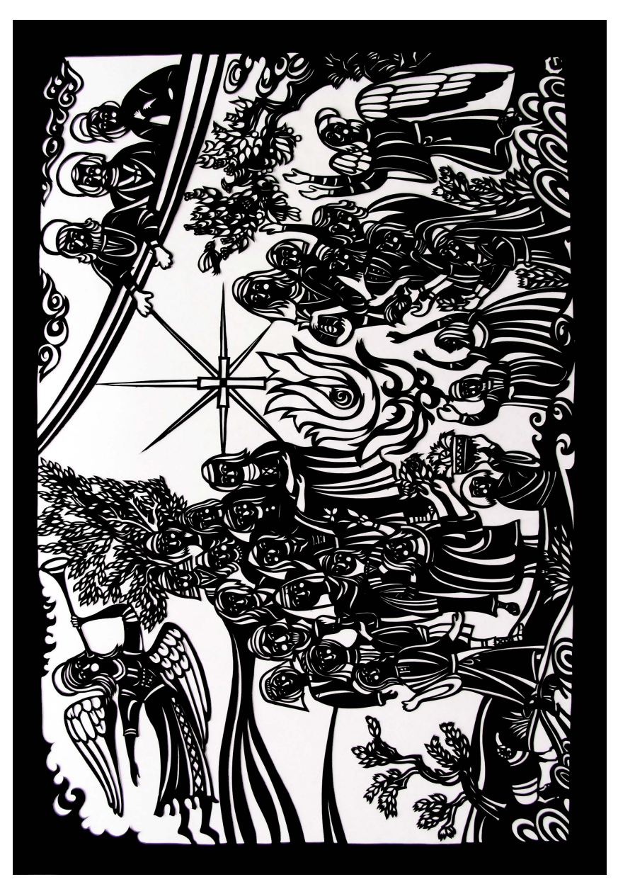
Image 3. Gen Tsuboi. Japan, God's Plan 1 , 2010. Kirie (Paper cut), 31 x 21.5 inches. Artist copyright.